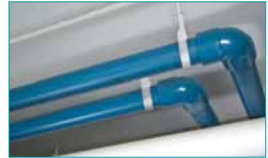
AquaRise is ideally suited for hot and cold potable water distribution through mains, laterals and risers.

Proven strength, competitive price, easy installation — what all this adds up to is significant time and cost-savings for contractors and building owners over the long term.