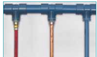
Transition fittings enable easy connections to other materials for greater job-site flexibility.

AquaRise interior & exterior walls remain smooth in any service condition, unlike metal which, over time, will rust, pit, scale & corrode.