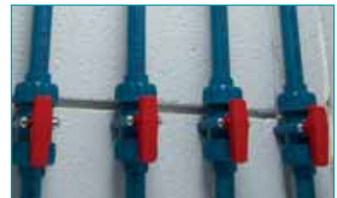
AquaRise is also ideal for smaller diameter plumbing applications including laterals, distribution lines and branch lines.