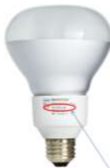
Model: EL/A R30 Dim 16W