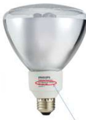
Model: EL/A PAR38 Dim 20W