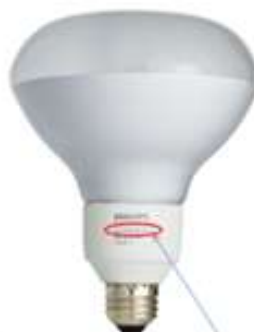
Model: EL/A R40 Dim 20W